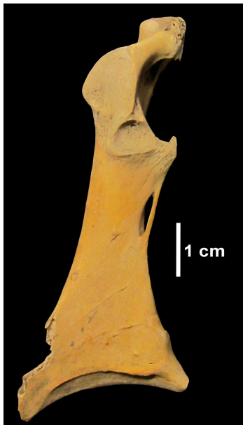
Fig. 3. Coracoid Anser anser domesticus (№AZ-337) from incisura n.supracoracoidei

Extraction could not have been hunted during the breeding season. In addition to loons, there are some species for nesting where forests and ponds of Polesye are unsuitable. They are Anser erythropus , Anser albifrons , Anser fabalis , Anas penelope , Netta rufina та Aythya nyroca . All the remains were found in the house, so Rook wasn't in the landfill accidentally. It can be assumed that a rook was eaten to quench hunger, but it is unlikely. Nature of Polesye is rich in birds and it is possible to find the better loot. We can support the assumption of Tereza Tomek that the birds with black feathers could be used with a particular religious order [10, p. 16].