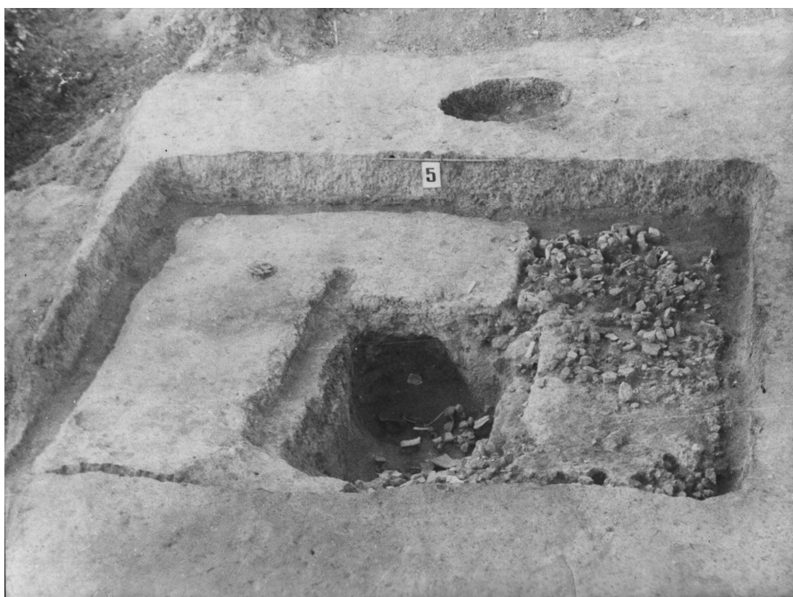
Fig. 1. Excavations in house № 5 in the settlement Stadnyky

Introduction. The remains of birds having been found at archaeological and paleontological excavations have been studied less thoroughly than remains of mammals or fish. 30 years ago A. Umanska [1, p. 3] paid attention to the lack of information about zooarchaeology research of birds in Ukraine. She published a number of interesting works in the field. But after her premature death in 1985, fossil and semi-fossil birds of Ukraine have not almost been studied. But also in world science the number of paleo- and archaeornitological research is insignificant [5, p. 49]. Thus the birds are one of the most numerous groups for both the number of species and human use. Excavation of the Old East Slavic settlement in the village (Ostroh District, Rivne Oblast) was carried out in 1980 under the leadership of one of the authors of this article (A. Bondarchuk). Especially rich material was obtained from house № 5 (Fig. 1, 2), where many bones of domestic animals were found. Also a few hundreds of fragments of birds' bones, which were handed over to National Museum of Natural History at the National Academy of Sciences of Ukraine (further NAMH), were found, but it was not until recently that they became identified. The results of identification are presented in this article.