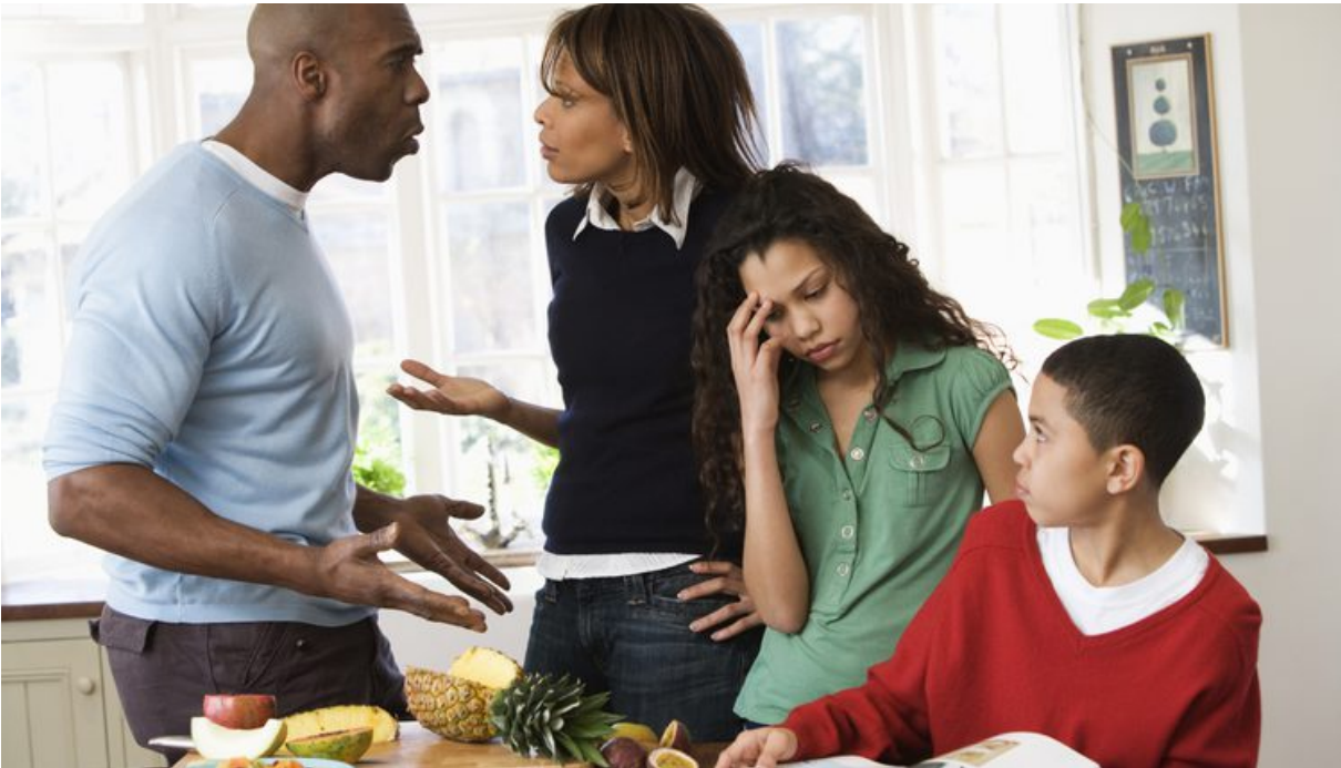
Conflict image 3