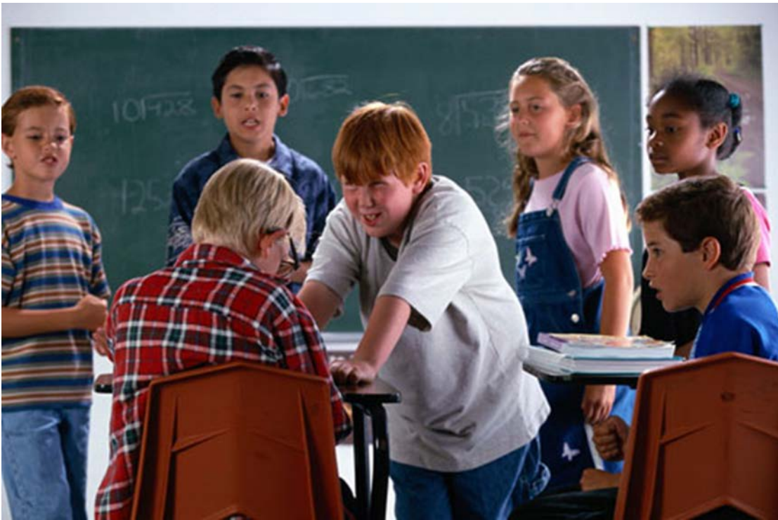
Conflict image 6