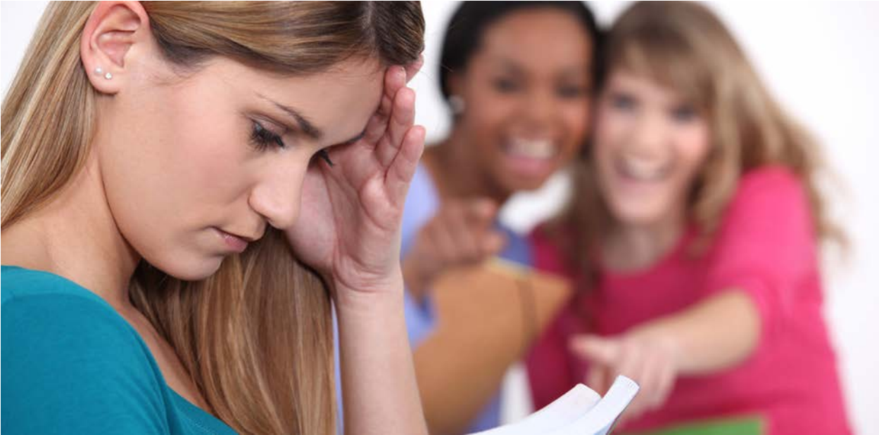
Conflict image 2