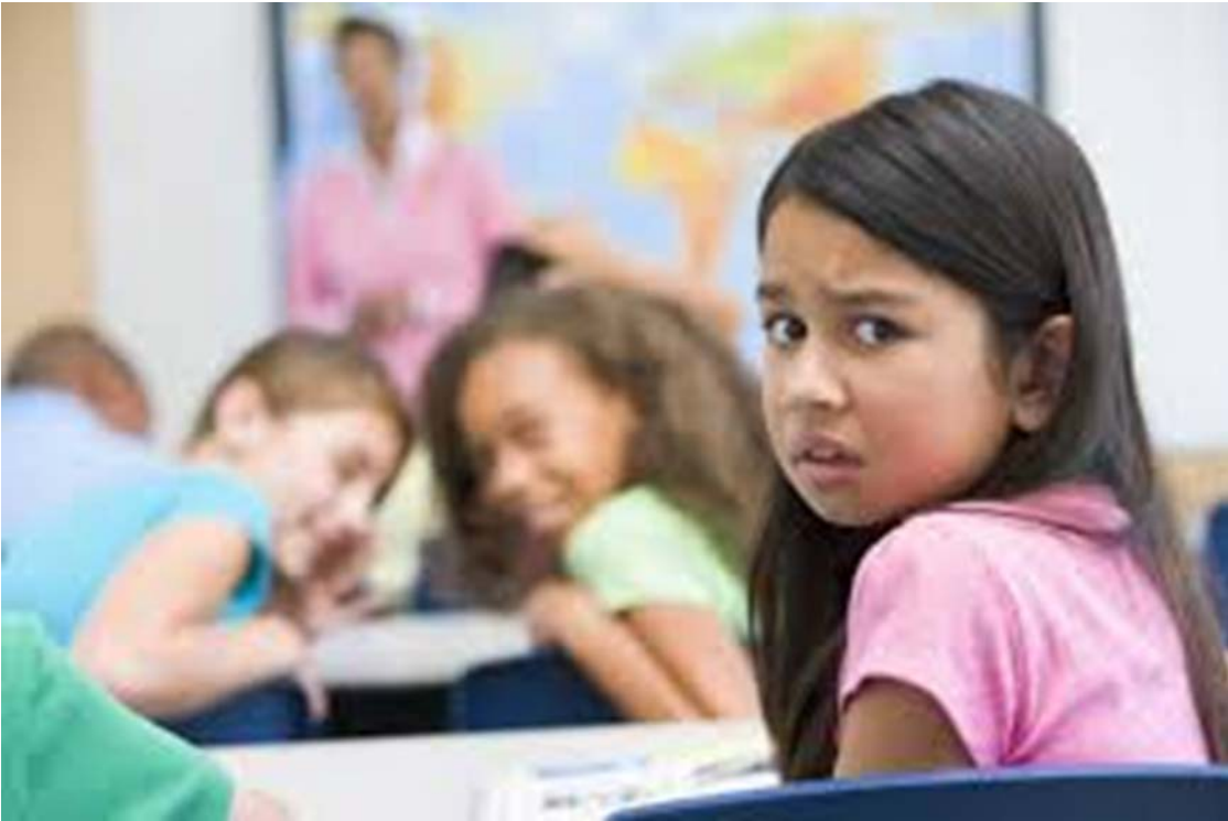
Conflict image 5