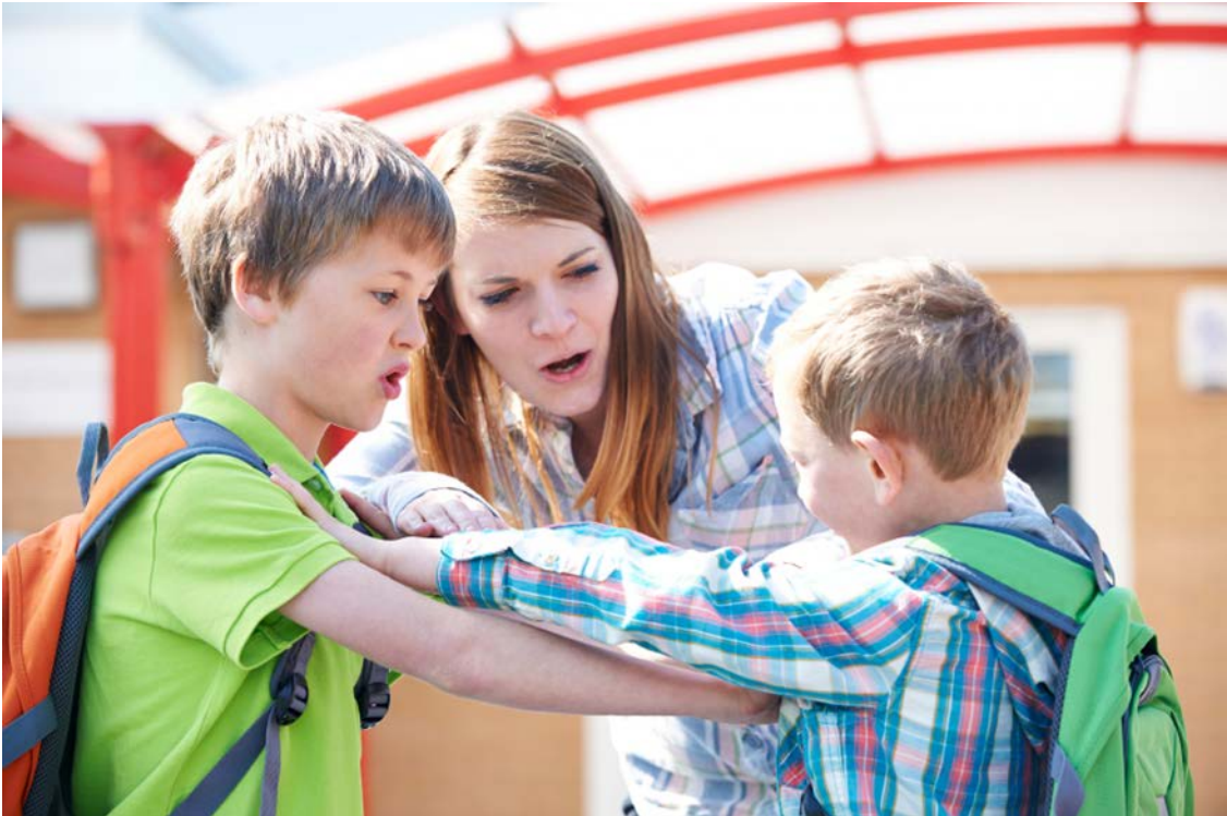
Conflict image 7