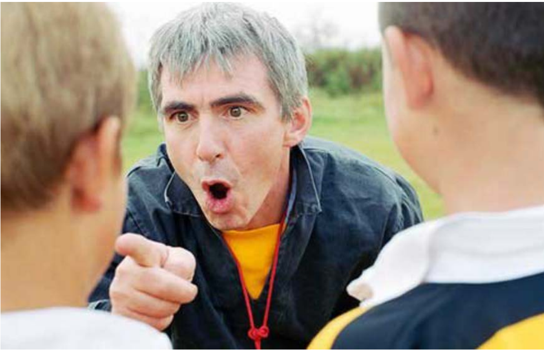
Conflict image 8