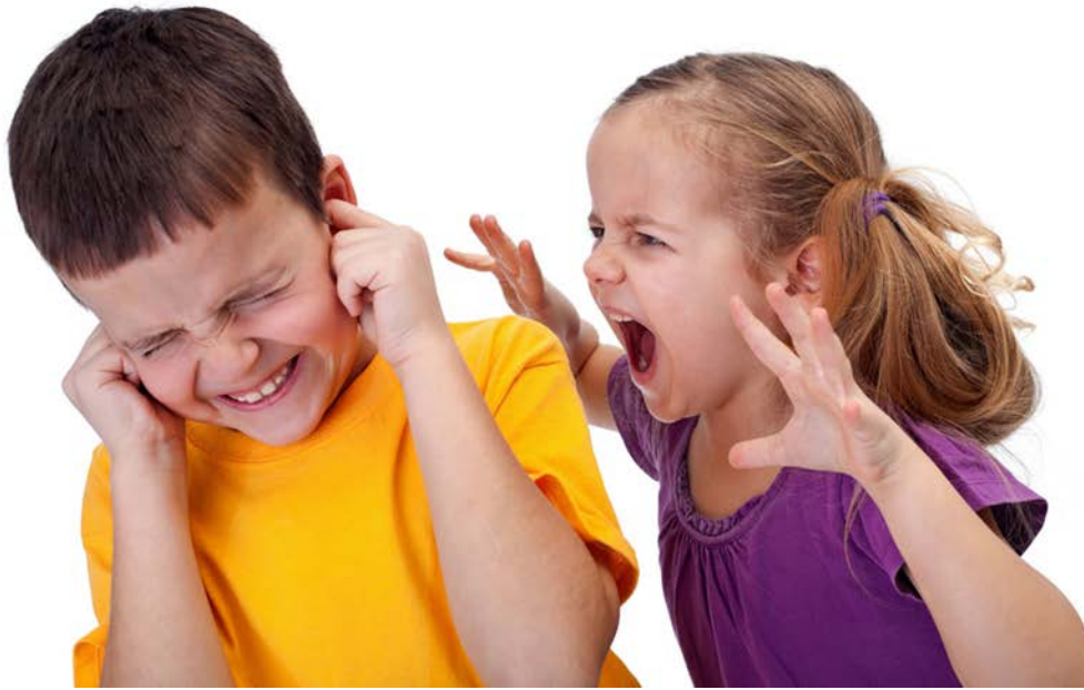
Conflict image 4